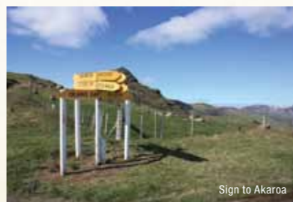
Sign to Akaroa