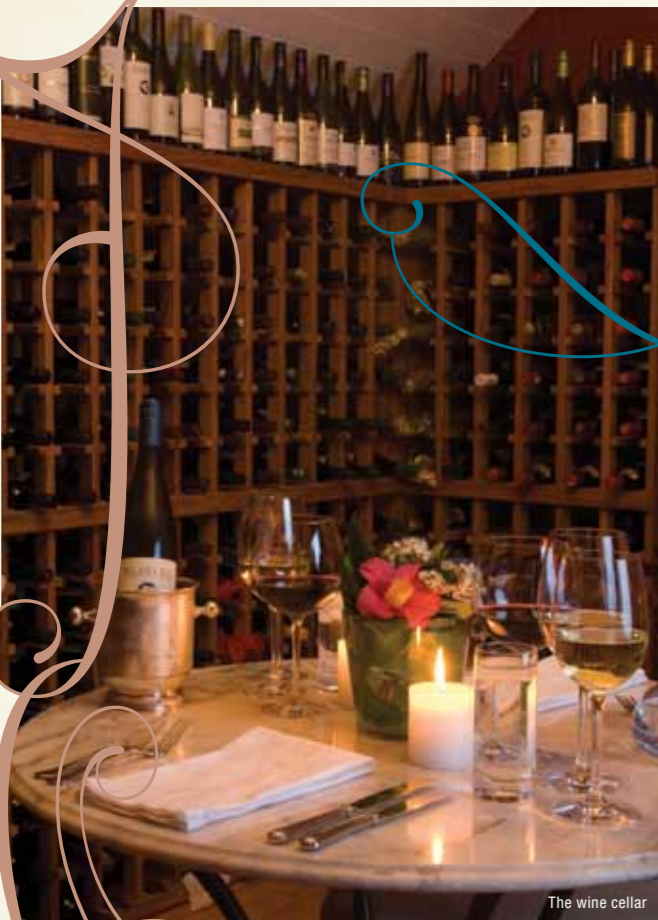
The wine cellar