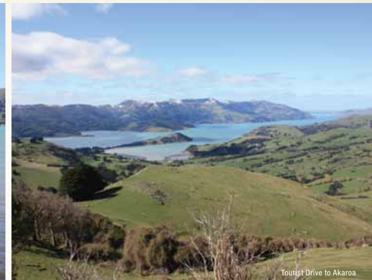
Tourist Drive to Akaroa

Once in Akaroa, you will not be bored. The town is full of beautiful art boutiques, cafés and homeware stores – plenty to do. The harbour is home to the world's smallest dolphins (Hector's dolphins), which can be experienced on one of the day cruises. You will also likely see seals, penguins, and marine salmon, as well as a variety of seabirds. All tours can be arranged by the Otahuna team, and they have plenty of suggestions for places to go – just ask!