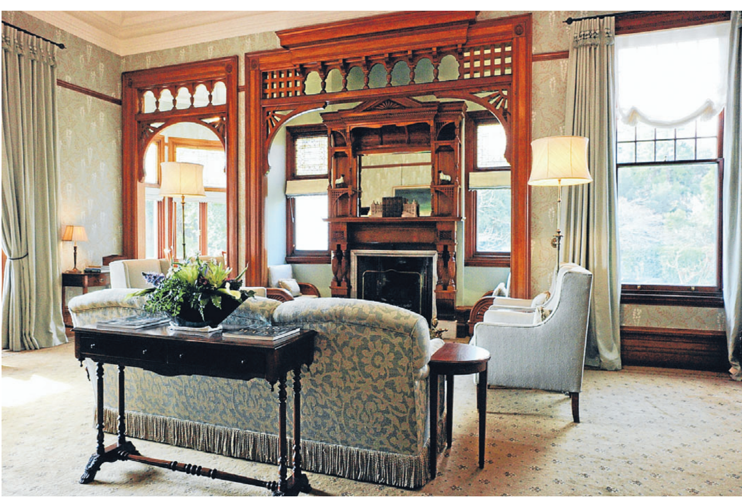
Classic furniture and fabrics were chosen to complement the historic character of the house, without turning it into a museum.