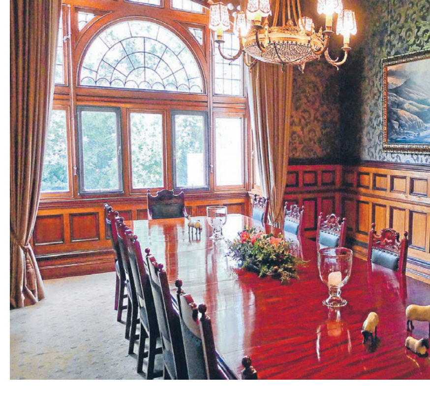
The original wallpaper in the formal dining room dates to the late 1800s.

suffered a "catastrophic level" of damage. Fortunately, being built of rimu and kauri timber, the homestead rolled with the punches and remained structurally sound, unlike big brick historic houses like Homebush, which collapsed.