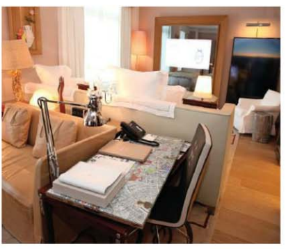
Inspired by the 1940s and 1950s, the Junior Suite offers a separate living area and bedroom with two large-screen TVs

WHAT TO LOVE The hotel has hosted and pampered prestigious luminaries for 80-plus years with a wealth of amenities and proximity—the best of Paris is but