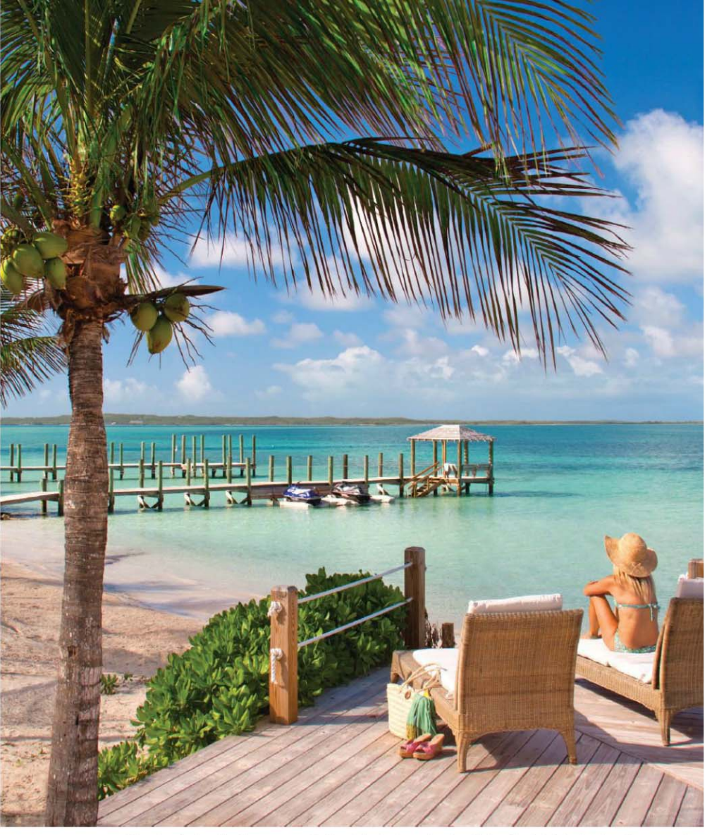
Three Bees is the only villa property on Harbour Island to have a beach on the bayside of the island, and a private one at that.