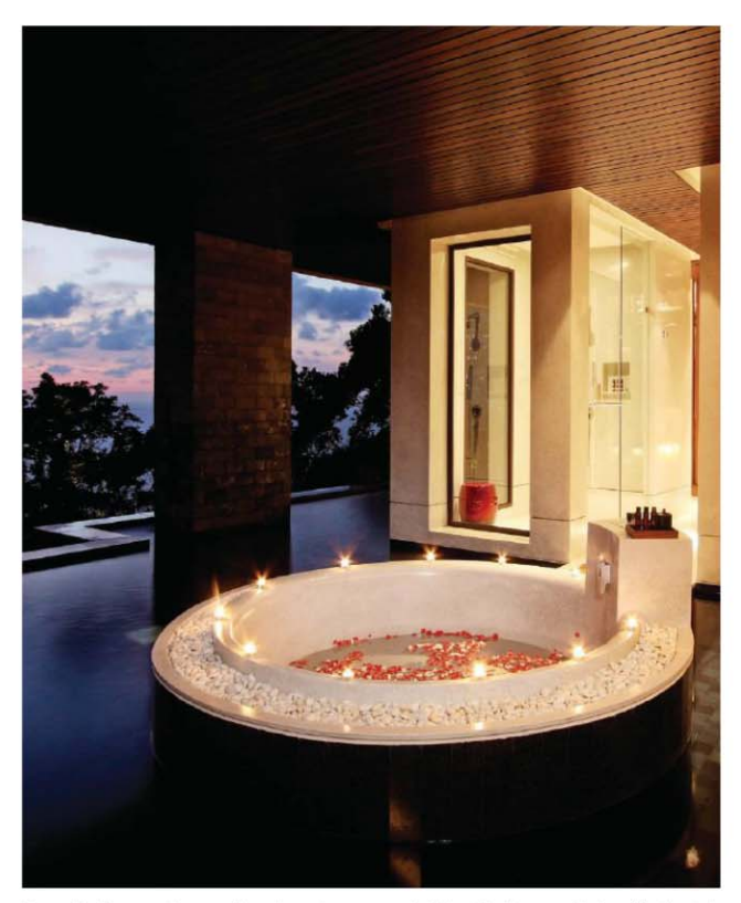
Dramatic views are the norm from the water-surrounded island bathroom with huge floating tub in the Dima Spa Suite