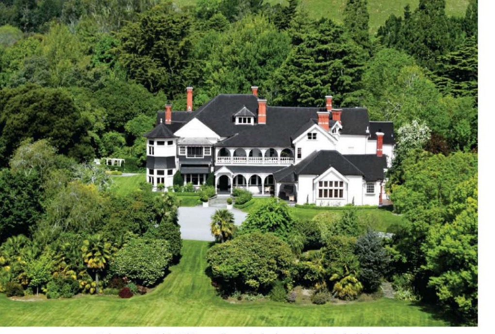
Otahuna Lodge, a Relais & Châteaux, offers a refined and customized New Zealand lodge experience.