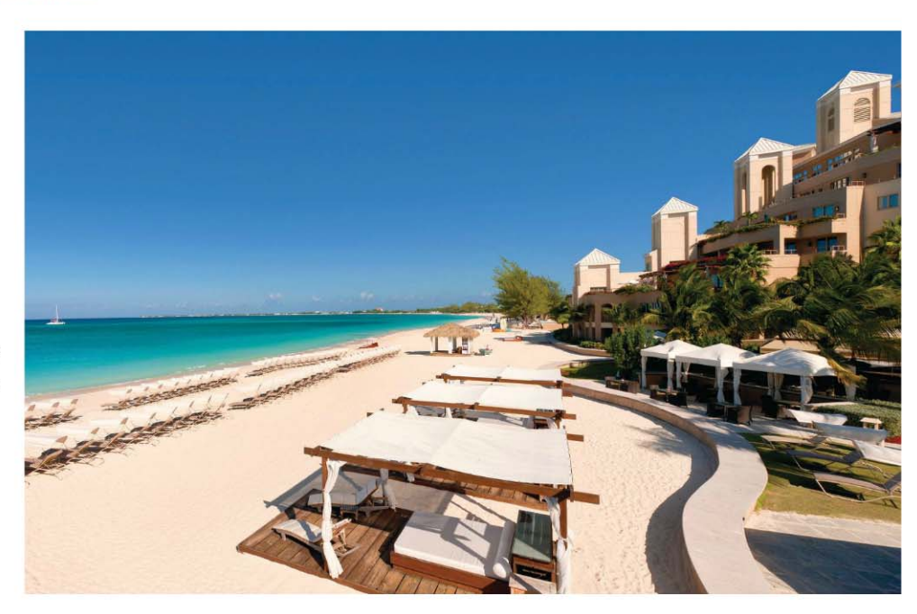
PACKAGE DEAL The Comfort You deal offers couples overnight accommodations in a spacious resort, garden or oceanfront guest room, with a $100 resort credit per night and a buffet breakfast for two at the lavish Seven restaurant. Starting at $419 per night, ritzcarlton.com

WHAT TO LOVE Idyllic blue waters, swaying palms and historic island charm set the stage for romance. Your theater? An oceanfront, ocean-, garden- or resortview accommodation of choice, all categories featuring indigenous design (think blue-ocean and yellow-sun saturations). Silver Rain, a La Prairie Spa pampers with innovative spa therapies and a mod, whitewashed relaxation space (where Champagne is served, of course). Recently refreshed, superlative dining venues-Blue by Eric Ripert, the Caribbean's only AAA Five Diamond resto, and Seven-dazzle discerning palates with headlining cuisine. Dine inside, alfresco or in an oceanfront cabana for two.