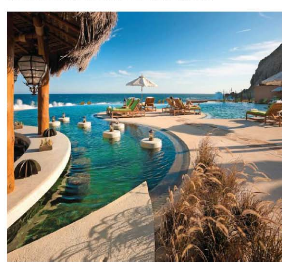
ouples can relax together at the infinity edge pool at Capella Pedregal.

PACKAGE DEAL The four-night Romance Under the Stars package includes a daily breakfast spread, roundtrip airport transfers and swoon-worthy extras (a couple's spa treatment, private dinner on the beach and more). Low-season rates start at $785 per night, capellahotels.com