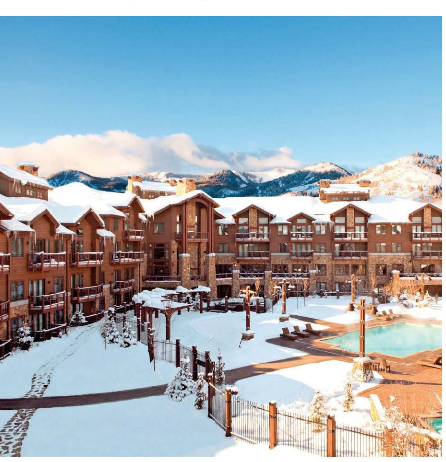
Slopeside\ at\ the\ Canyons\ Resort\ is\ the\ Waldorf\ Astoria\ Park\ City-the\ ideal\ locale\ for\ year-round\ outdoor\ activities

PACKAGE DEAL Take pleasure in the two-night Couples Retreat package, offering sparkling wine upon arrival, a 50-minute couples massage, rose-petal turndown and a $50 breakfast-in-bed reward credit each morning. In summer, stay in a standard guest room for $389 or a standard one-bedroom guest residence for $669; winter retreats start at $829 for a standard guest room and $1,109 for a one-bedroom guest residence. Additional nights can be easily added: Summer starting rates are $209 for a standard guest room and $489 for a one-bedroom guest residence; winter starting rates are $649 for a standard guest room and $929 for a one-bedroom guest residence. parkcitywaldorfastoria.com