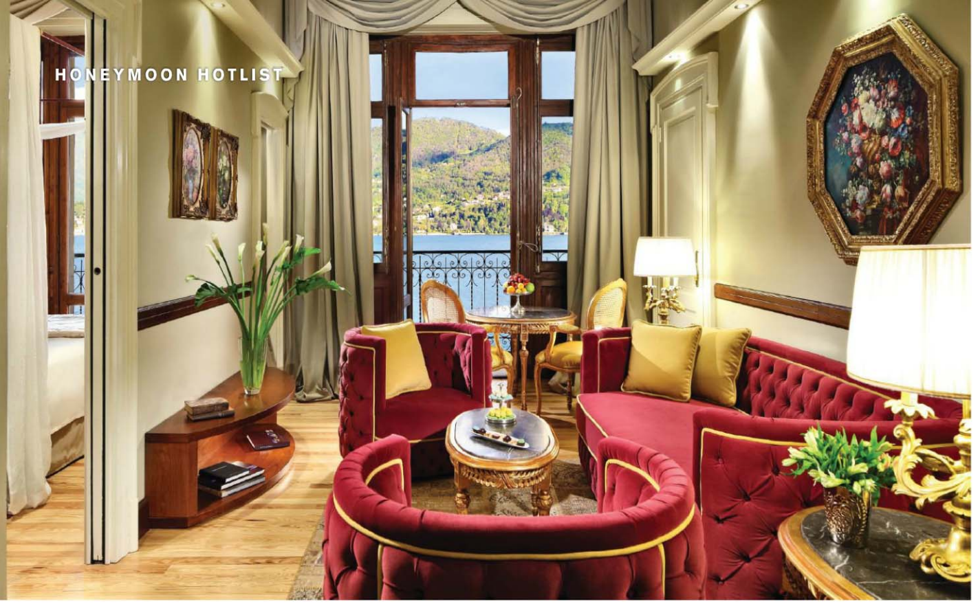
Charm and romance were the design inspiration for the luxurious Honeymoon Suite Maria.