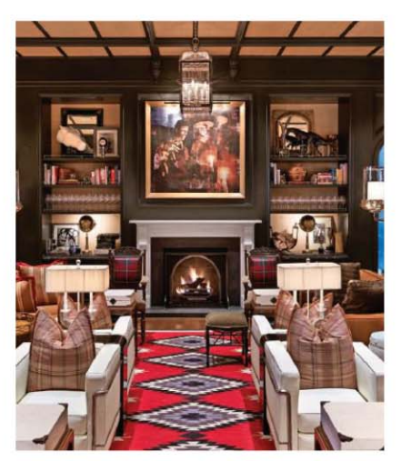
The new Living Room is the perfect spot for mixing and mingling with other hotel guests and locals alike.

PACKAGE DEAL Honeymooning is la dolce vita, where a three-night (or longer) stay in luxury accommodations is just the beginning. Daily breakfast, a candlelit dinner for two at La Terrazza in view of magical pink vistas playing off Lake Como, and a tour of its touted waters aboard the Venetian lancia are also included. Awaiting your arrival is sparkling Spumante with a complement of strawberries and chocolate. Honeymoon packages start from $1,510 per night, grandhoteltremezzo.com