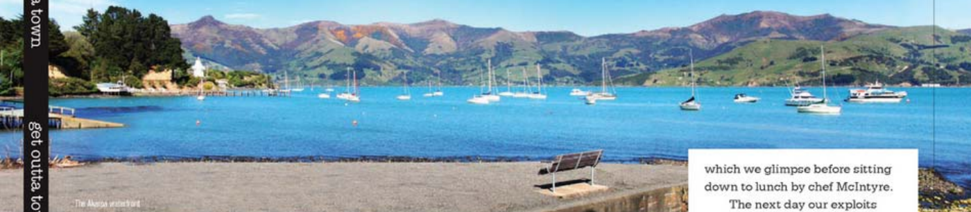
The Akaroa waterfront