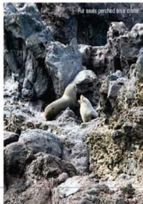
Fur seals perched on a crater

Beckoning us from bed each morning is a come-as-you-are