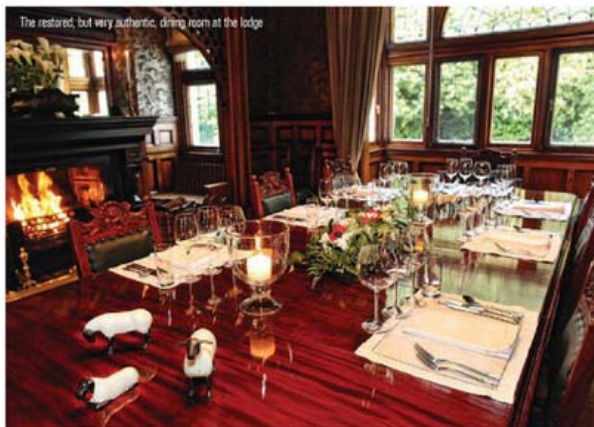
The restored, but very authentic, dining room at the lodge