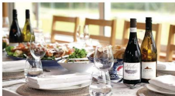
A lovely lunch at Mt. Somers Station featuring Sugar Loaf wine

Otahuna's culinary program utilizes what is grown on-property, plus sources from nearby farms—an ethos with a celebrated reputation furthered by pristine service. Highlights of this particular dinner include Denver leg of venison with potato fondant; Otahuna spring vegetables and peach chutney; and lime leaf, lemongrass, ginger and coconut pudding with passion-fruit sorbet and mango salad.