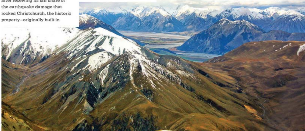
Snow-capped Southern Alps, as seen from the helicopter tour of the area