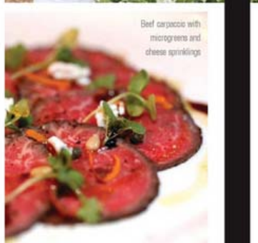
Beef carpaccio with microgreens and cheese sprinklings