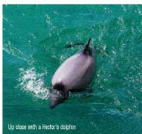
Up close with a Hector's dolphin