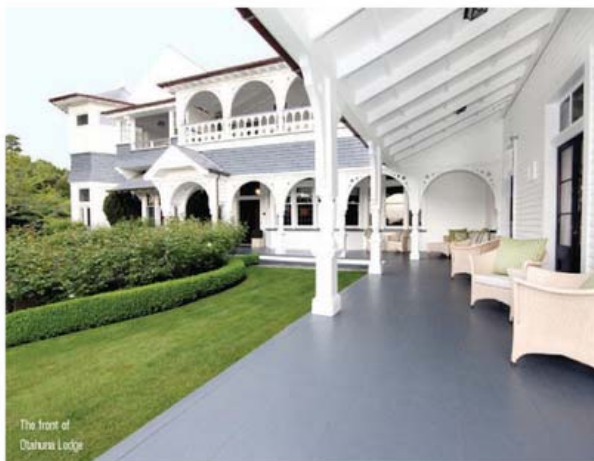
The front of Otahuna Lodge

Although a buyout of intimate Otahuna is an option, it's engaging to meet up with other savvy travelers, their