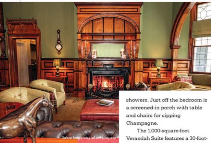
Otahutu Lodge's early fall and sitting area

names etched in a guest book in the lobby, itself a beauty with hunter green walls, Rimu paneling, leather furnishings and a crackling fireplace (one of 15 wood-burning total chimney spots throughout). It all calls for a refined sense of casually elegant ambience that pays homage to its rich history and founding owner.