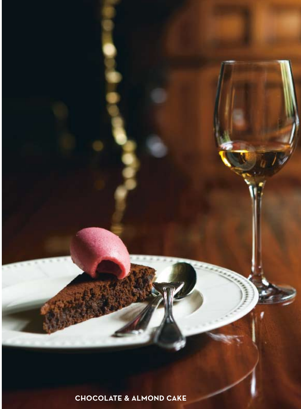
CHOCOLATE & ALMOND CAKE

Mix the fruit and sugar together and place in a saucepan with a tight-fitting lid.